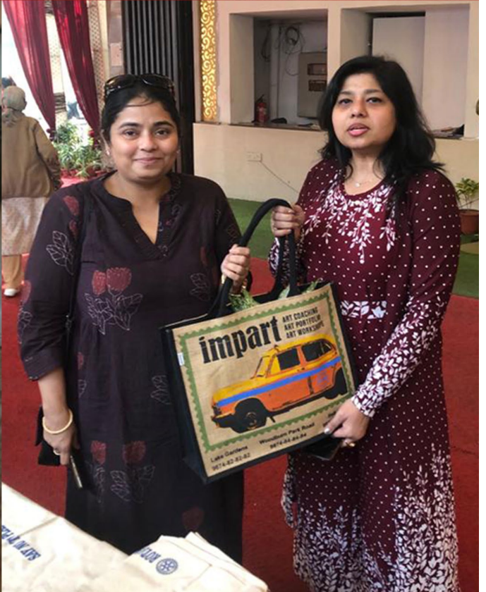
Visitors who got hampers from the event of Kolkata kettle.